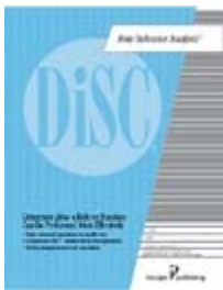
Role Behavior Analysis